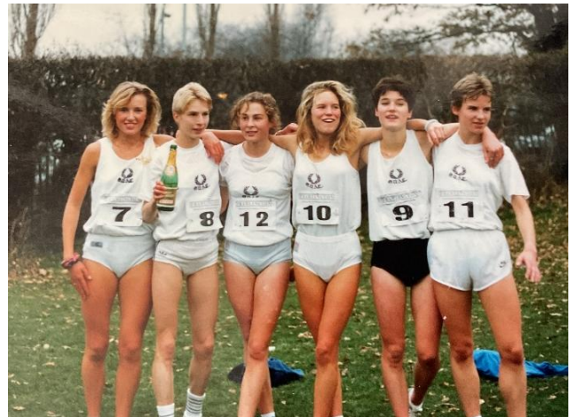
1989 Blues Varsity Match Winners