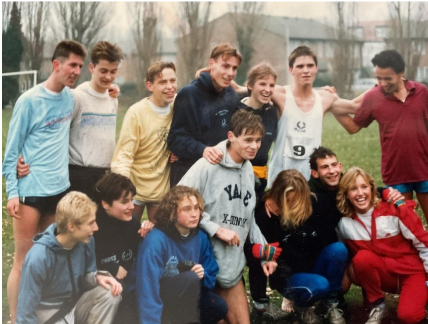
1989 Post-Varsity Fun