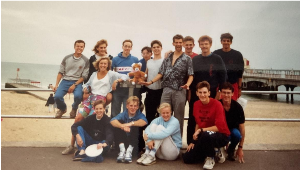
Pre-season training camp at the New Forrest after a game of frisbee